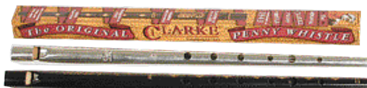
7020 and 7021