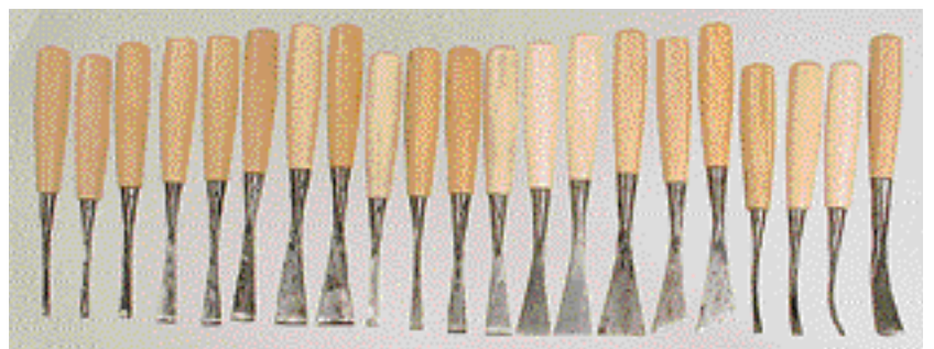
A B C D E F G H I J K L M N O P Q R S T U