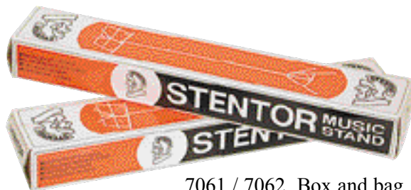
7061 / 7062 Box and bag