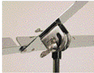
Secure desk hinge