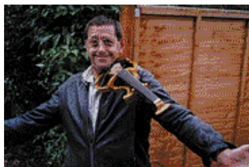
Legendary fiddle player, Dave Swarbrick uses a P&H carbon fibre bow

'Stentor' is the registered trademark of STENTOR MUSIC CO. LTD.