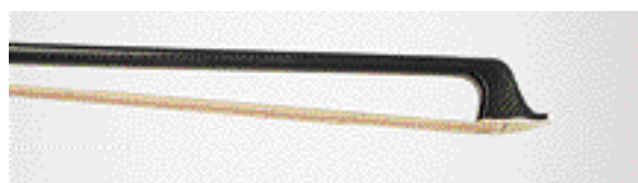
P&H Carbon bow - 1552